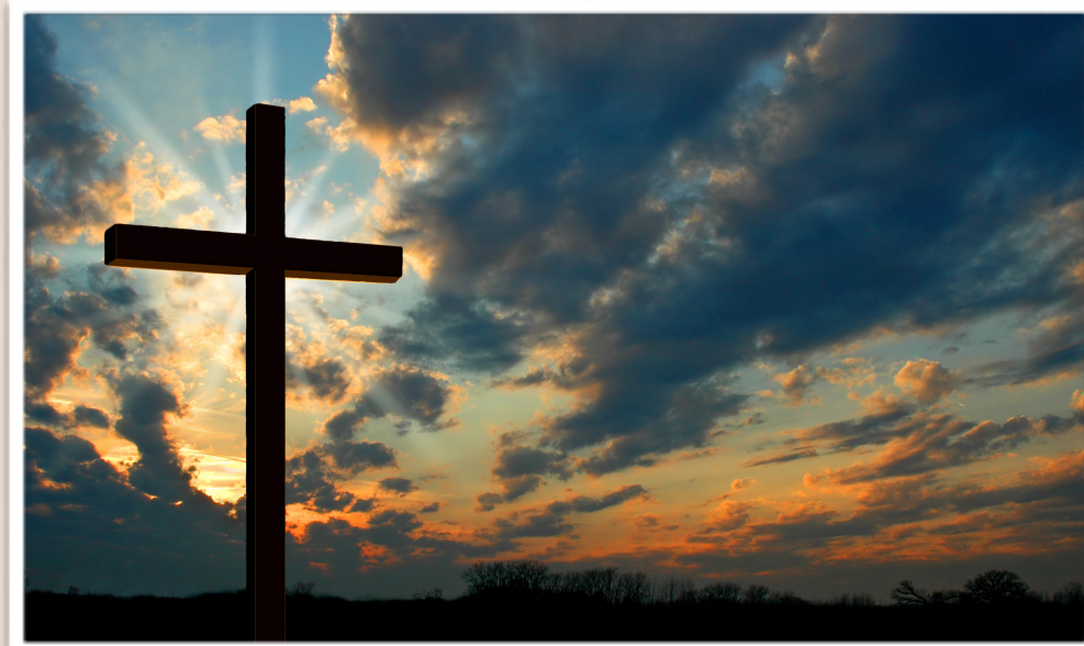
Building A Bridge To God By Unknown

“God is a Spirit; and they that worship him must worship him in spirit and in truth.” John 4:24